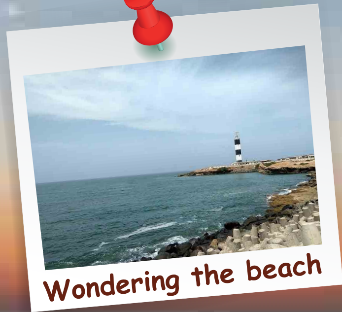
Wondering the beach