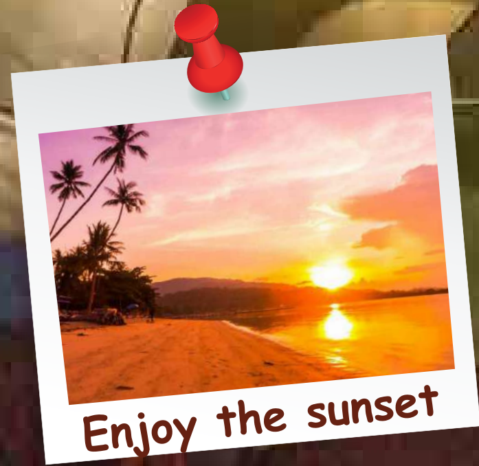
Enjoy the sunset